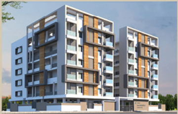
SAANVI SILVER SPRINGS