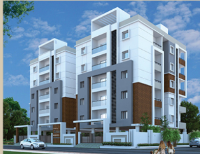
SAANVI AUROVILLE HOMES