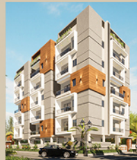
SAANVI ADVIATA HOMES