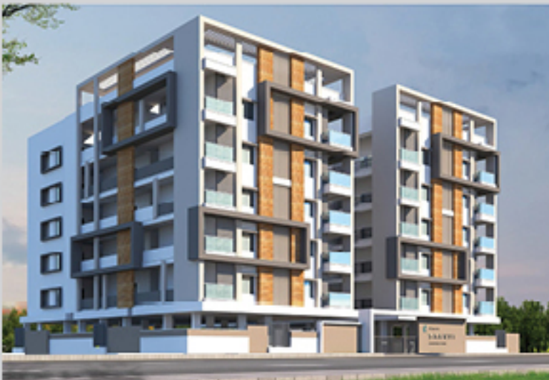
SAANVI SILVER SPRINGS