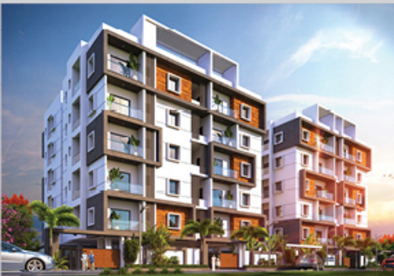
SAANVI AURELIA HOMES