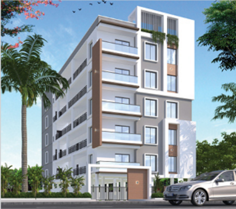
SAANVI AVASA HOMES